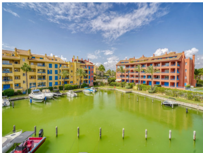
Close to lots of amenities and beach

All information is correct to the best of our knowledge. Errors and prior sale excepted. This prospectus is purely for information purposes. Only the notarized deed of sale is legally binding.