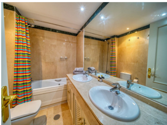
Apartment with 2 bathrooms