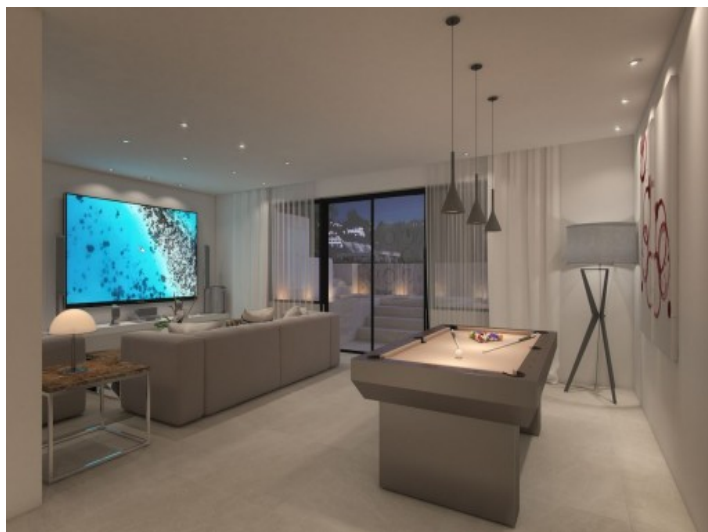
Seperate games room