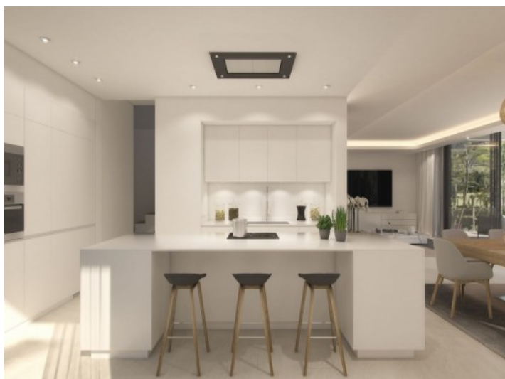
Modern, fully equipped kitchen