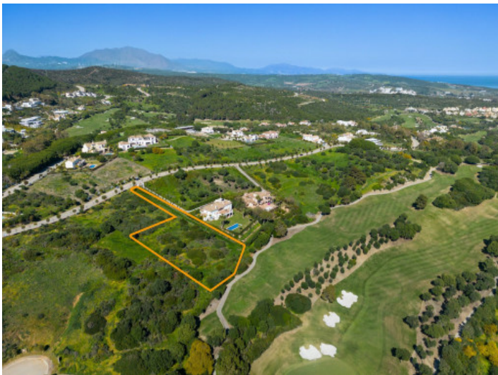
Plot of land

All information is correct to the best of our knowledge. Errors and prior sale excepted. This prospectus is purely for information purposes. Only the notarized deed of sale is legally binding.