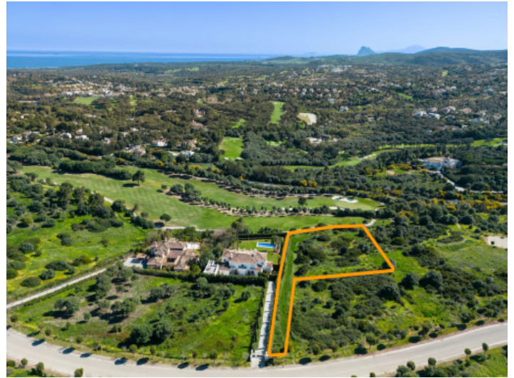
Plot of land nearby the sea