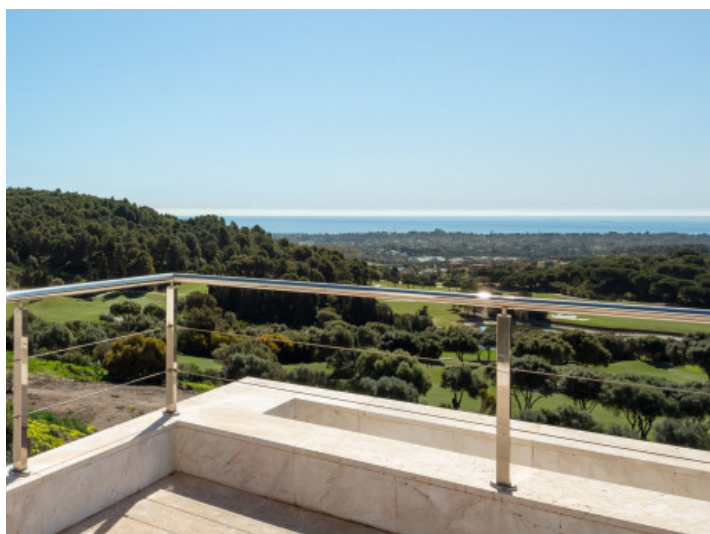
Sunny terrace with splendid views