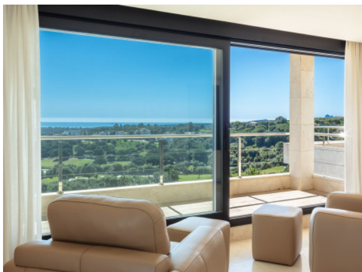
Living area with a panoramic view