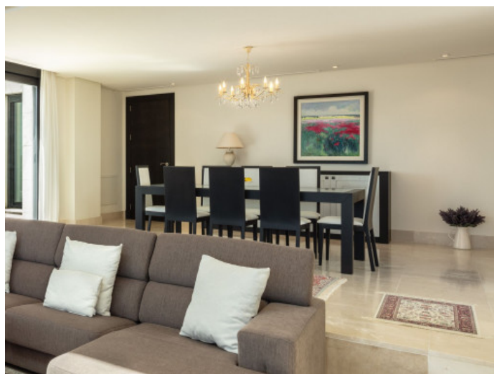
Large living and dining area