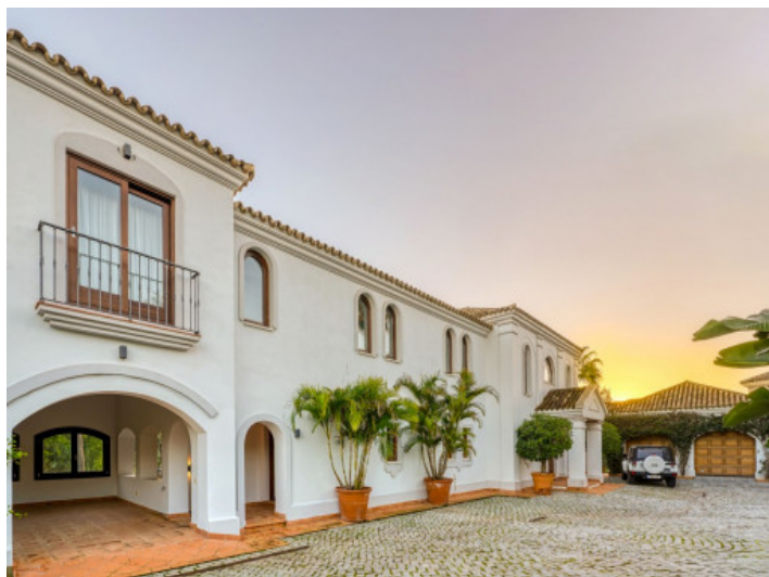
Elegant and unique property