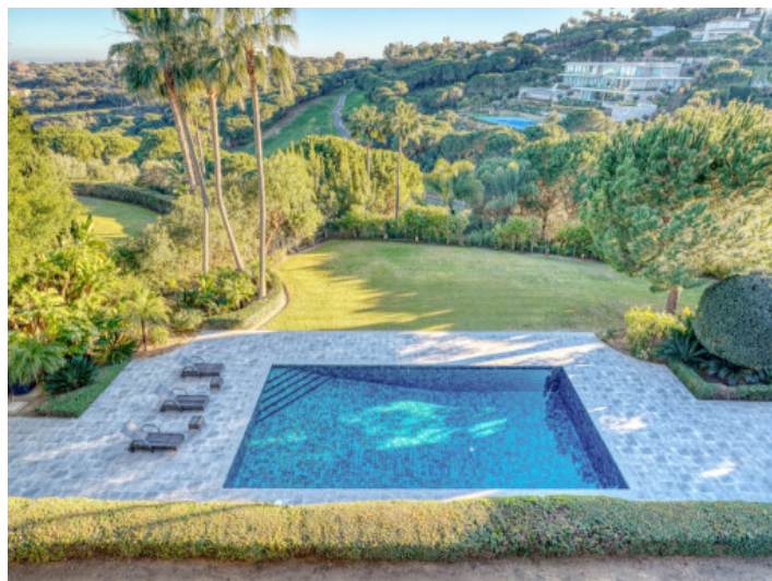
Beautiful pool and garden