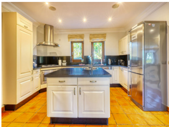
Country style kitchen